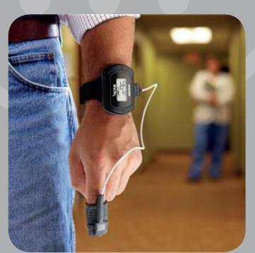
NONIN® WRISTOX₂™ 3150 PULSE OXIMETER with finger sensor

Testing patients was just made easier by combining BreezeSuite software's six-minute walk test (6MWT) option with the Nonin® WristOx₂™ 3150 Bluetooth Pulse Oximeter. Since testing is being performed within BreezeSuite™ cardiorespiratory diagnostic software, there is no need for long cables or transferring of data from one device to another. The pulse oximeter data is captured seamlessly within BreezeSuite software and is stored directly to the software's database.