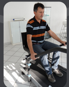
Support chair movable and removeable