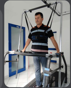
Structure support for safety harness with auto-stop