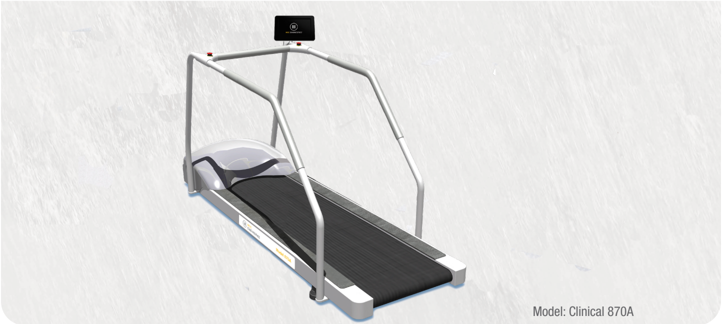
Model: Clinical 870A

RAM treadmills are perfectly adapted for use in clinical, rehabilitation and sports medicine applications.