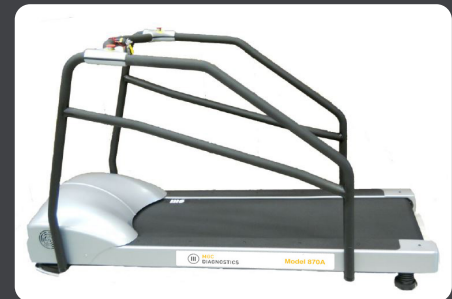
Pediatric Hand Rail

ALSO AVAILABLE: Belt for HR Monitoring with Bluetooth® technology