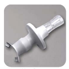
preVent flow sensor attached to preVent<sup>™</sup> filter and patient mouthpiece